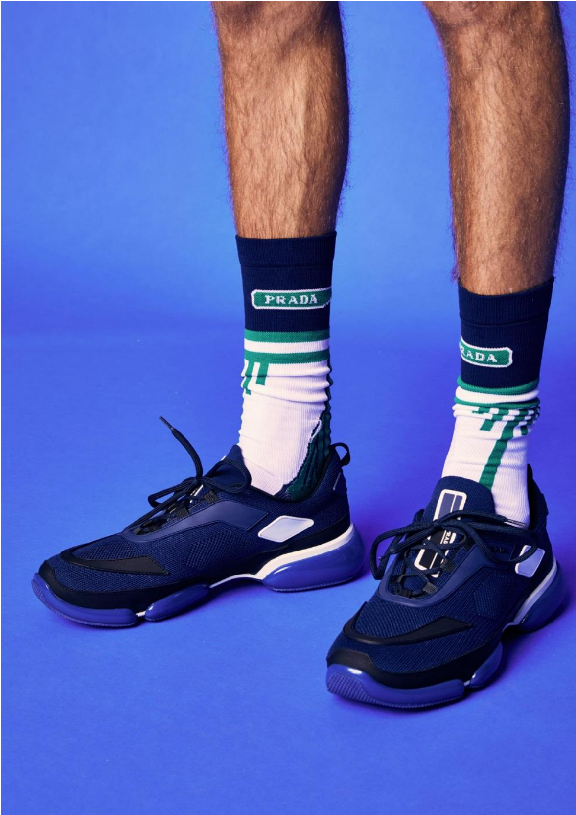
AUSTRALIA - PRADA - ICON - NOVEMBER