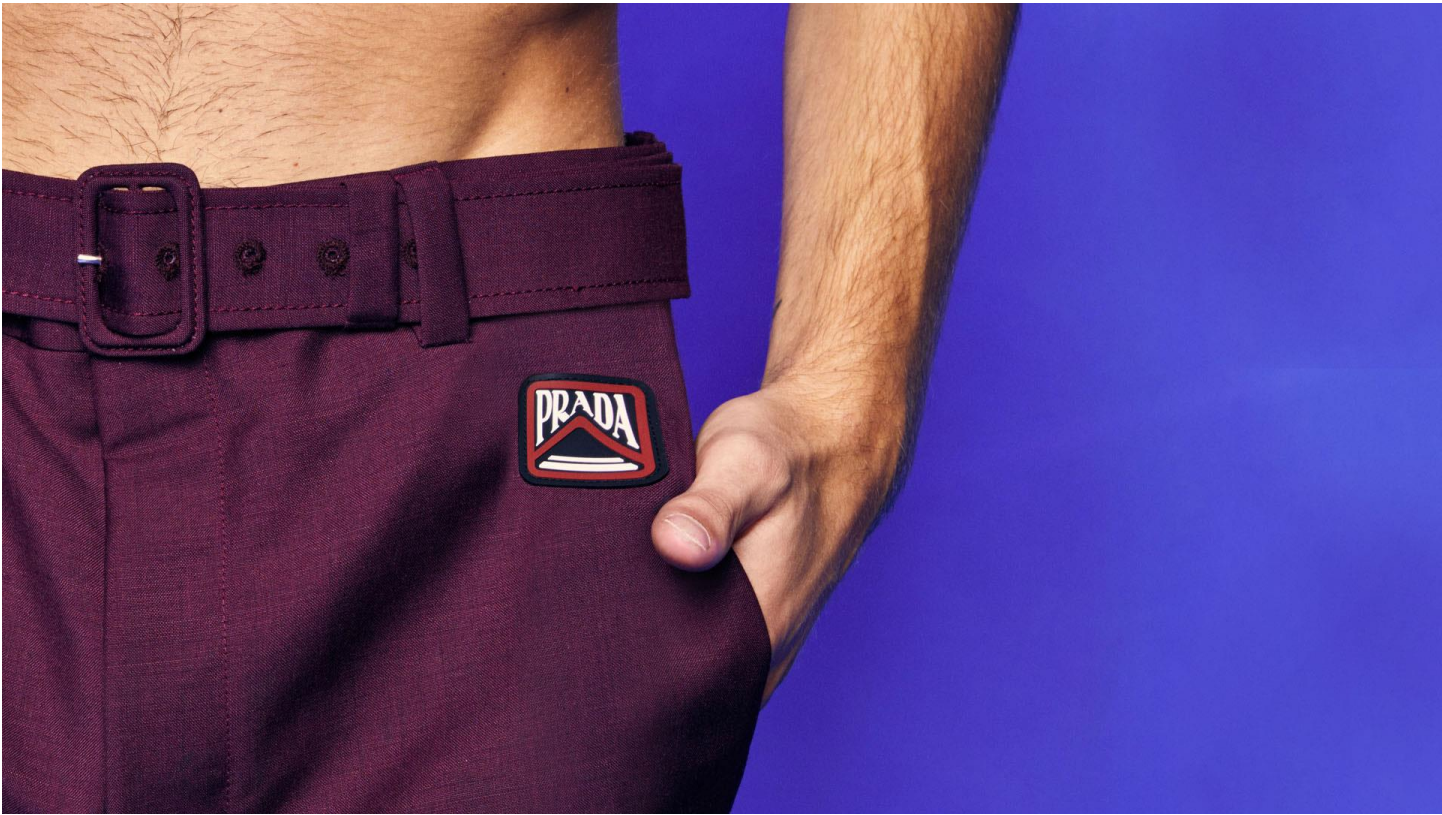
AUSTRALIA - PRADA - ICON - NOVEMBER